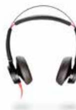
Plantronics Blackwire 7225