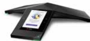
Poly Trio 8800

The Plantronics Calisto speakerphone family delivers high-quality audio solutions for small conference or huddle rooms and personal conferencing.