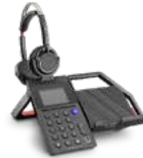
Poly Elara 60 Series