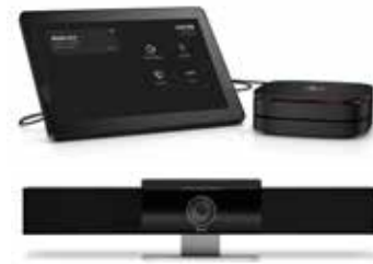
Poly Solution Bundles with HP and Lenovo Microsoft Teams Rooms

Polycom RealConnect for Microsoft Teams or Skype for Business provides video interoperability with standards-based video endpoints such as Polycom and Cisco, using Microsoft Outlook for scheduling, and enabling one-click join functionality. Now available as a cloud service or through on-premises collaboration infrastructure.