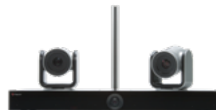
Polycom EagleEye Director II