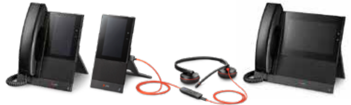
Poly CCX Series

Polycom VVX line offers solutions that are certified for Skype for Business, and connects to Microsoft Teams via a voice gateway.