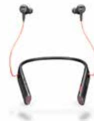
Plantronics Voyager 6200 UC

The Plantronics Blackwire family gives you a broad selection of corded UC devices that deliver outstanding audio quality and reliability, ease of use and price points to meet any budget.