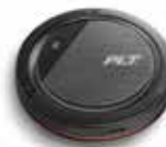
Plantronics Calisto 5200