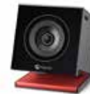
Polycom EagleEye Cube USB