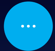
AND MANY MORE