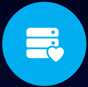
SERVER HEALTH MONITORING