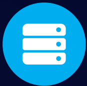
SERVER ROOM MONITORING