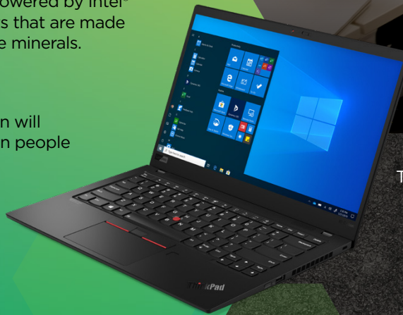
ThinkPad® X1 Carbon

Learn more about our environmental, social, and governance (ESG) efforts at www.lenovo.com/esg .