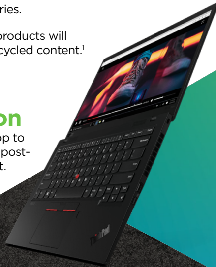
ThinkPad® X1 Carbon

Meet the first Lenovo laptop to be made with closed-loop post-consumer recycled content.