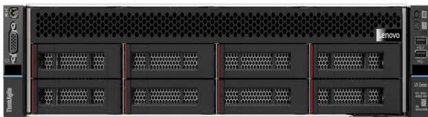
ThinkAgile VX V3 2U Front View 8x 3.5" drive bays