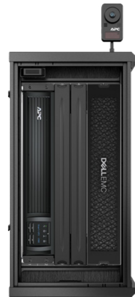
DELL EMC PowerEdge™ XE2420 Edge Server within a Schneider Electric, 6u Wall Mounted Micro Data Center

Schneider Electric and Dell share a channel-partner network spanning the globe, providing IT expertise and management wherever needed.