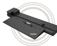
ThinkPad® Performance Dock PN: 40A50230XX