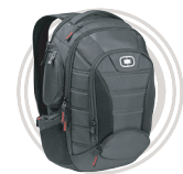
Ogio Bandit 17" Backpack (Black) PN: 111074.03