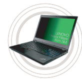
Lenovo™ Privacy Filters from 3M™