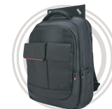
ThinkPad® Professional Backpack - Up to 15.6" PN: 4X40E77324