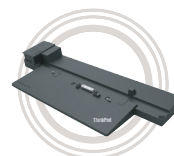
ThinkPad® Performance Dock PN: 40A50230XX