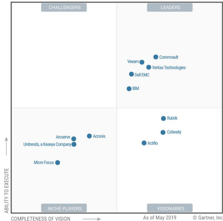
Figure 1. Magic Quadrant for Data Center Backup and Recovery Solutions