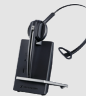
D 10 USB