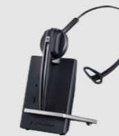
D 10 PHONE