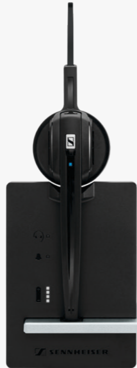
D 10 Series