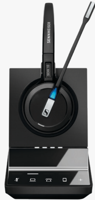
SDW 5000 Series