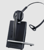
D 10 USB ML