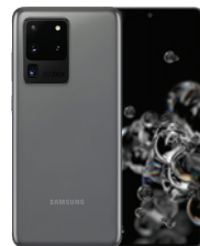
Galaxy S20 Ultra

Contact Us: samsung.com/unlockedforbusiness