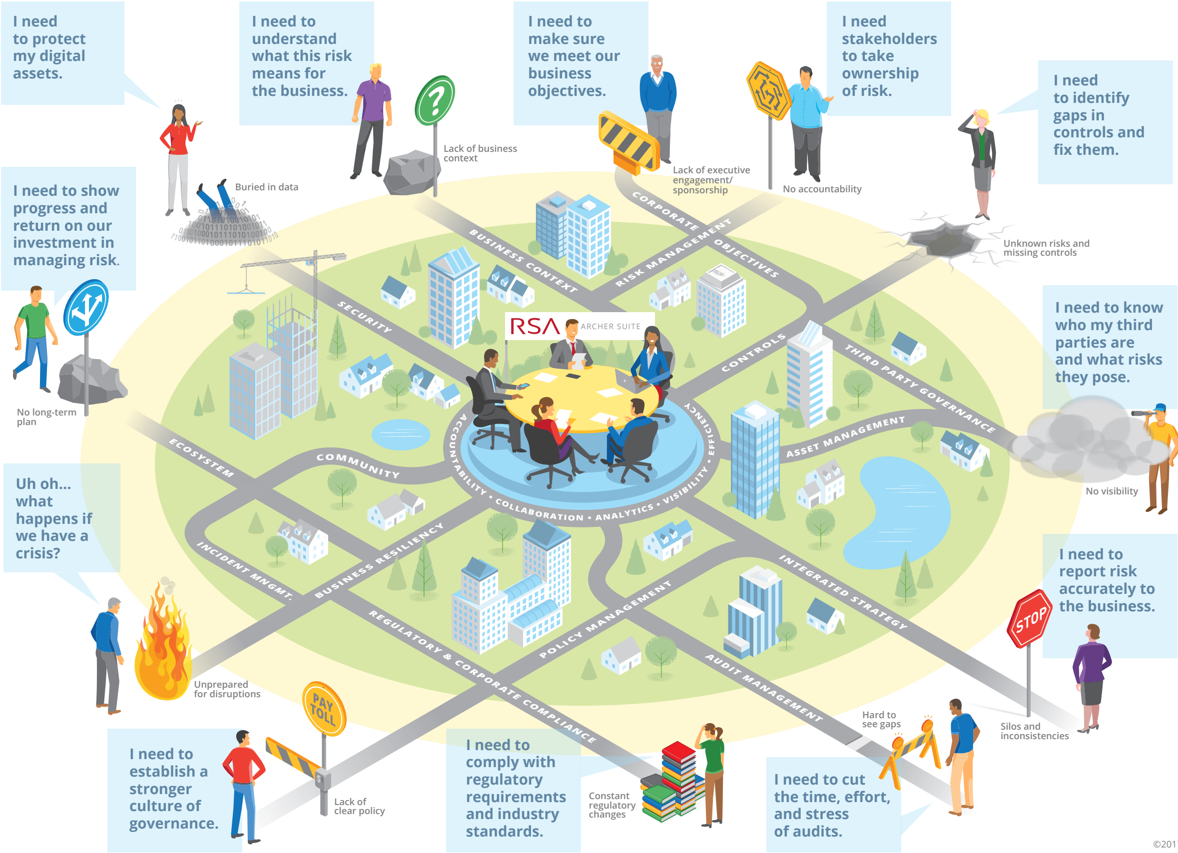
RSA Archer Maturity Stages

RSA Archer® provides business risk management solutions that allow you to start your risk and compliance program where it hurts and chart the path that makes the most sense for your organization. Wherever you begin, RSA Archer gives you the confidence to deliver strategic value to your organization with a proven path—and the right solutions—to take control of risk.