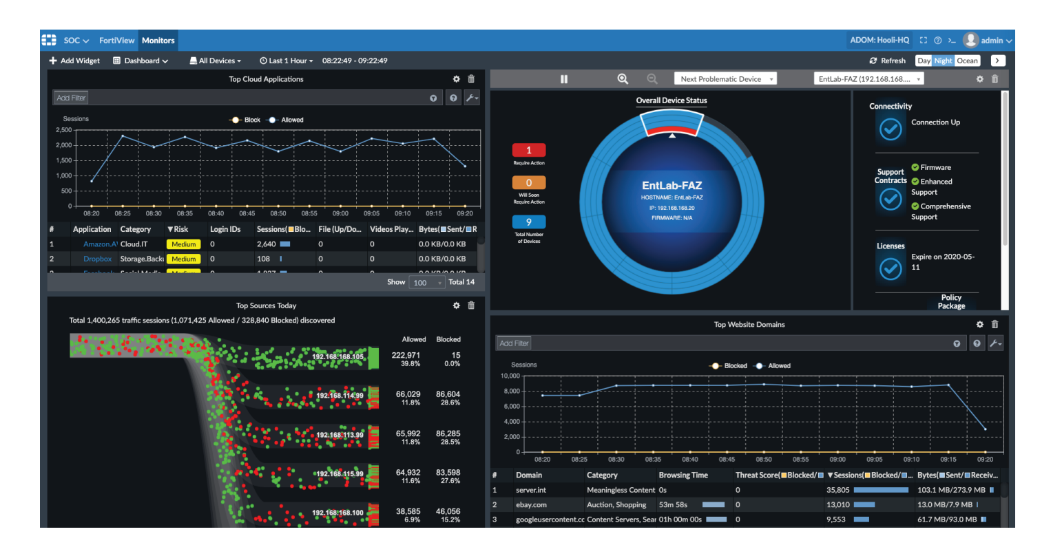
Figure 3: FortiManager dashboard view.

The unique single-platform approach of the FortiGate Network Firewall, which includes flexible deployment options, delivers end-to-end protection that is easy to buy, deploy, and manage. Centralized security management and visibility consolidates multiple management consoles into a single pane of glass and unlocks automation-driven management. Specifically, a highly intuitive view of applications, users, devices, threats, cloud service usage, and deep inspection gives network engineering and operations leaders a better sense of what is happening on their network. With this strategic view, they can easily create and manage more granular policies designed to optimize security and network resources.