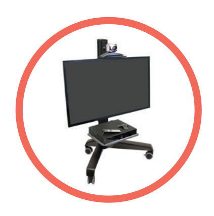
Mobile Media Center

Moves for individual or group work with no assembly