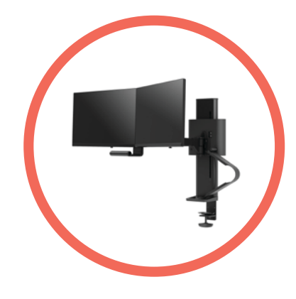
TRACE™ Monitor Mount

Support safe spacing: Mobile workspaces enable physical distancing for team meetings or individual work