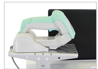
SV Scanner Shelf