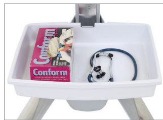
SV Front Tray