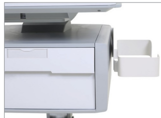
SV Sharps Container Drawer-Mount Bracket Kit