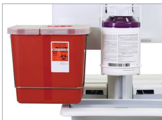
Sharps Container T-Slot Bracket Kit