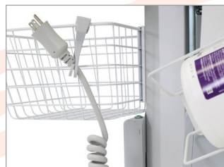
Coiled Extension Cord Accessory Kit