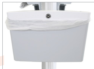
SV Storage Bin