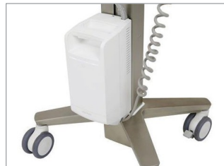
LiFeKinnex Power System