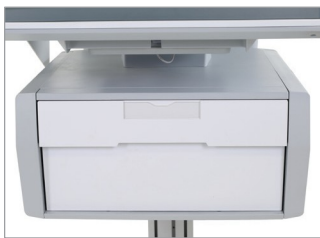
SV Primary Storage Drawer, Single Tall

*Compatible with drawers. Choose 97-959 for carts without drawers.