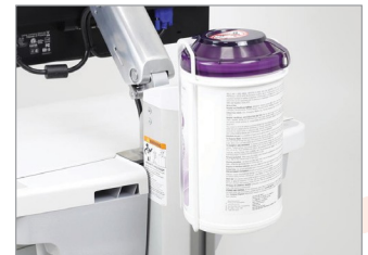
T-Slot Wipes Holder