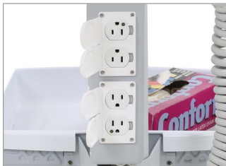
Medical-Grade Power Strip