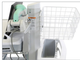
SV Wire Basket, Small