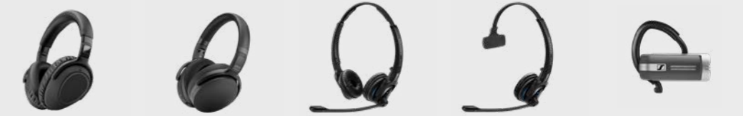
ADAPT 660 ADAPT 360 IMPACT MB Pro 2 UC ML IMPACT MB Pro 1 UC ML IMPACT Presence Grey UC