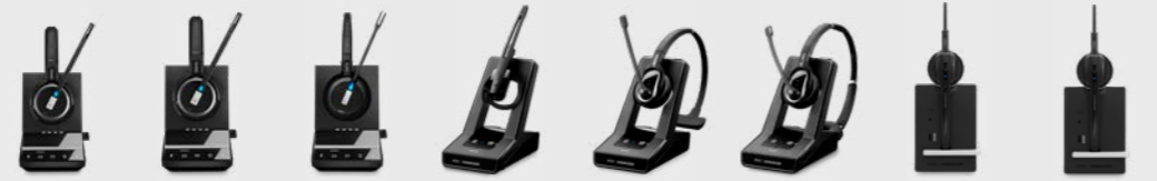
IMPACT SDW 5066 IMPACT SDW 5036 IMPACT SDW 5016 IMPACT SD Office ML IMPACT SD Pro 1 ML IMPACT SD Pro 2 ML IMPACT D 10 IMPACT D 10 USB ML