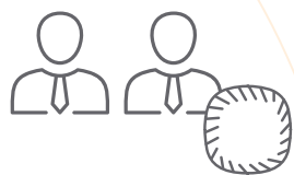
Aruba Access Points Collect Smart Telemetry Location Data

You will hear a lot about using location data, but how do you turn that into useful contact information? Many wireless vendors will supply a large amount of raw data—which is table stakes, but then it's left up to you to interpret how to use this data for employee health and safety solutions. How do you distinguish between contacts that are separated by walls from true personal interactions? Given that we all use multiple devices, how do you build a comprehensive contact profile that correlates devices to users? Will the data provide a proximity "risk score" to prioritize action? Aruba offers location solutions that start with precision location data post-processed by AI-based Machine Learning and are visualized by graphically-rich applications to solve these challenges. You are provided with accurate contact and location information without the guesswork. This relieves HR from the overhead and delays associated with correlating data and manual analysis, so they can focus on protecting employees.