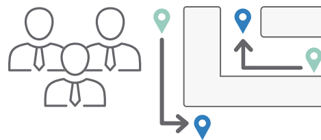
HR queries contact tracing SW