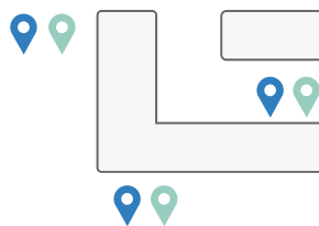
Data streamed to visualization and AI/ML Proximity Models