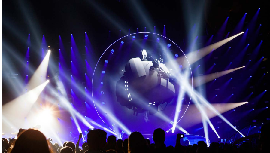
Queen + Adam Lambert world tour stage